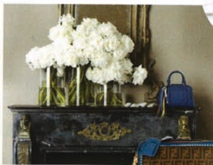
The new Silvana Mangano collection from Fendi

This year's Superyacht Rendezvous promises to be an unforgettable experience. Hosted in Porto Montenegro, guests will be struck by the awe-inspiring surroundings of the Bay of Kotor and be able to enjoy the fabulous local hospitality and culture of this beautiful region. Additional yachts joining the Superyacht Rendezvous are the 45.7m Palmer Johnson Blue Ice , 47m Heesen Elena , 46.9m Burger Boat Ingot and 41m Horizon Komokwa . The superb programme of events will include a glamorous party at the luxurious Porto Montenegro Yacht Club and a welcome cocktail evening. For more information, visit superyachtrendezvous.com .